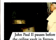
John Paul II pauses before the ceiling vault in Ferrara