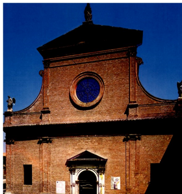
Church of Saint Mary in Vado, Ferrara