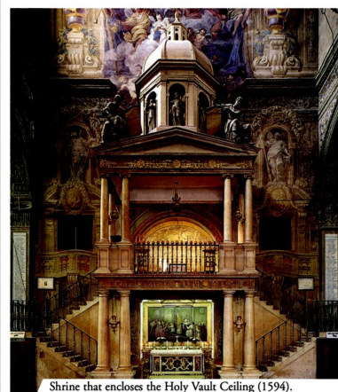
Shrine that encloses the Holy Vault Ceiling (1594). Right side of the cross