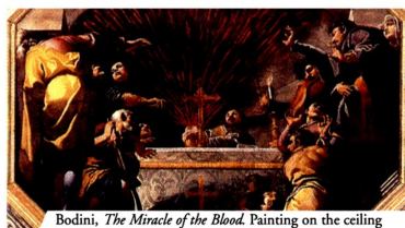
Bodini, The Miracle of the Blood . Painting on the ceiling near the shrine