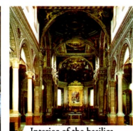
Interior of the basilica