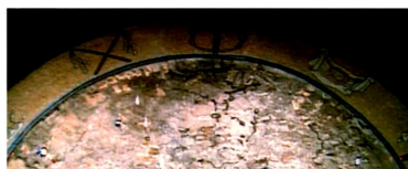
The ceiling crypt stained with Blood