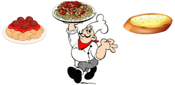
SPONSORED BY ACTS MINISTRY

OPPORTUNITY BASKETS Join us for an evening of food and fun!